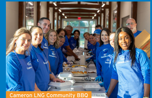
Cameron LNG Community BBQ