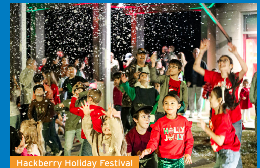
Hackberry Holiday Festival