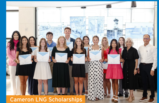
Cameron LNG Scholarships